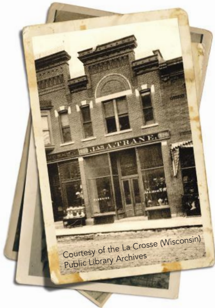
Trane Storefront La Crosse, Wisconsin 1891

When it comes to heating and cooling homes, people view Trane equipment as the most reliable and longest lasting in the industry.* That's because we use premium materials and time-tested designs that deliver more comfort for less energy, with reliability that's legendary throughout the business. When you trust Trane, you're trusting the leader.